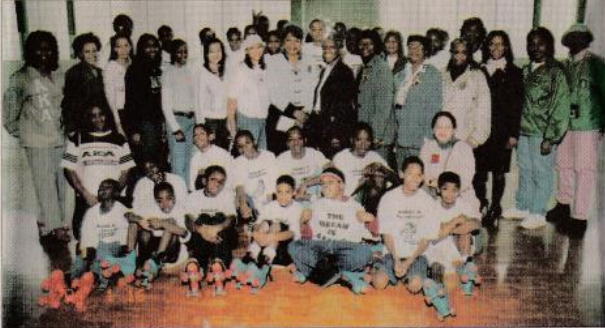
Sorority members hosted a skating party for students from Audubon and Nathan Hale middle schools. The party was held at the Zelma George Recreation Center.

activities have worked. All of the events and activities planned for this special Martin Luther King Day Project have served to increase awareness and knowledge of the nonviolent movement, the "Six Principles" to make life better and Dr. King's dream.